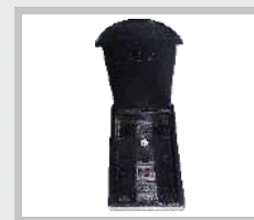
1 Photometric Channel