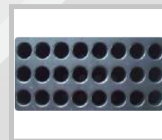
24 Positions Incubator